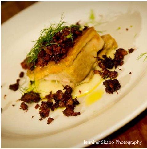
Jennifer Skabo Photography